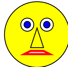
Figure 11-19: A sample widget

>>> from reportlab.lib import colors >>> from reportlab.graphics import shapes >>> from reportlab.graphics import widgetbase >>> from reportlab.graphics import renderPDF >>> d = shapes.Drawing(200, 100) >>> f = widgetbase.Face() >>> f.skinColor = colors.yellow >>> f.mood = "sad" >>> d.add(f) >>> renderPDF.drawToFile(d, 'face.pdf', 'A Face')